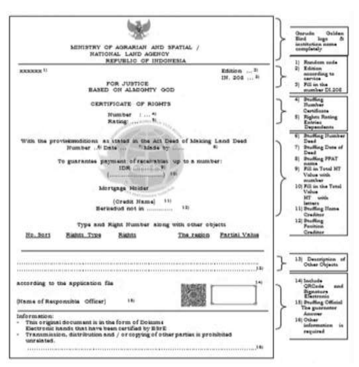
Figure 1. Example of mortgage

In the statement letter made by the applicant, it must be signed and stamped. As well as the validity and correctness of the documents submitted are in the applicant, and if there are document errors, based on Article 19 of the Regulation of the Minister of Agrarian Affairs and Spatial Planning / Head of the National Land Agency Number 3 of 2019, that for errors in filling data, it is permissible to make corrections to mortgage certificate. And certificate of mortgage rights repair issued then the mortgage certificate that has been previously issued is no longer valid. The mortgage certificate issued is signed electronically by the authorized official and provides a Qrcode. Regulation or legality of electronic signatures is regulated in Regulation of the Minister of Agrarian Affairs and Spatial Planning / Head of National Land Agency Number 3 of 2019 concerning the application of Electronic Signatures. Electronic Signature is a signature consisting of Electronic Information that is attached, associated or related to other Electronic Information that is used as a verification and authentication tool (Article 1 number (1)). The form of electronic mortgage rights certificates can be seen in Figure 1.